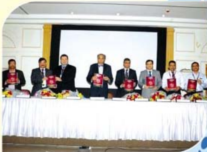
Release of Souvineer