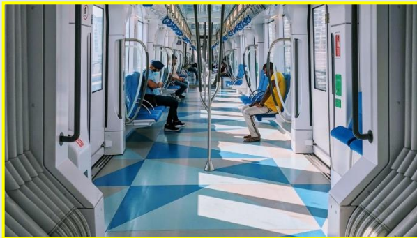
EAST WEST GREEN LINE METRO SERVICE ON HOWRAH MAIDAN - ESPLANADE STRETCH