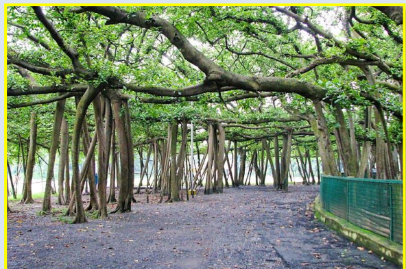
INDIAN BOTANIC GARDEN, SHIBPUR, HOWRAH