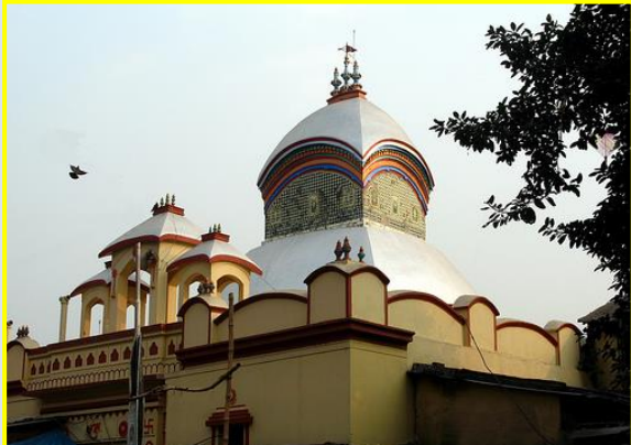
KALIGHAT KALI TEMPLE